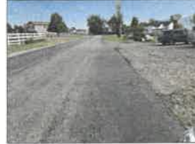
NORTH LEG OF 4300 WEST LOOKING NORTH

4300 WEST - 4000 SOUTH INTERSECTION IMPROVEMENTS - WEST HAVEN, UTAH