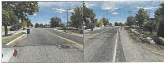
SOUTH LEG OF 4300 WEST LOOKING NORTH