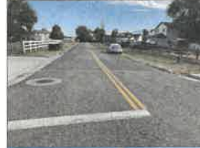
NORTH LEG OF 4300 WEST LOOKING NORTH