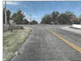
NORTH LEG OF 4300 WEST LOOKING SOUTH