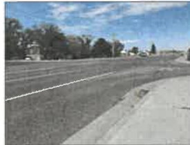
4000 SOUTH LOOKING WEST