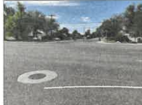
SOUTH LEG OF 4300 WEST LOOKING SOUTH